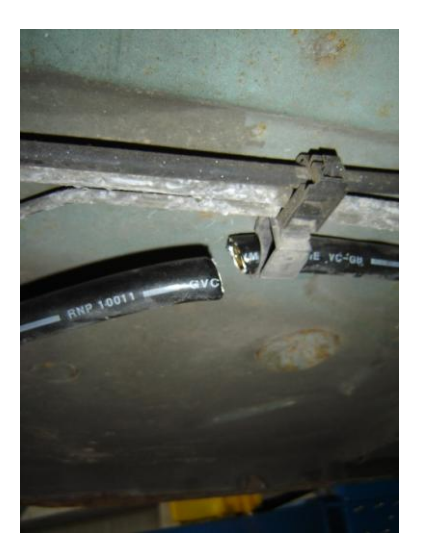
Once cut lower the pipes which were connected at the front and gentle pull the Hydragas pipe through